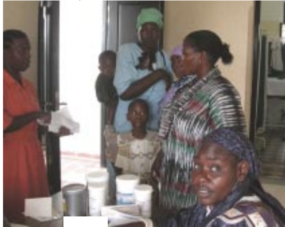
A health worker explains the cervical screening program to women visiting the Ocean Road Cancer Institute in Tanzania.

doctors involved in the projects described above have been intensively trained in screening, colposcopy, cryotherapy and LEEP, in courses jointly organized by the IARC, INCTR and WHO/