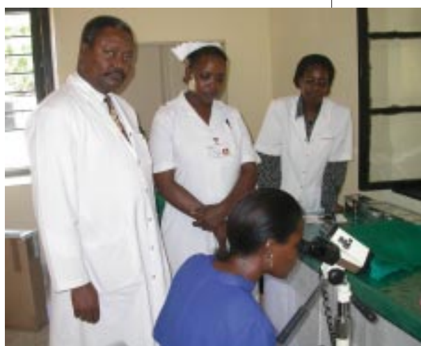
Doctors in Tanzania learn how to perform examinations with a colposcope during a training session sponsored jointly by IARC and INCTR.

as positive, on one or both tests, will be investigated further with colposcopy, and biopsies will subsequently be taken in those with abnormal findings. Women with histologically confirmed cervical intraepithelial neoplasia grades 2 and 3 (CIN 2 and CIN 3), located on the ectocervix, without extension into the cervical canal will then be randomized to receive 'single'- or 'double-freeze' cryotherapy treatment. 'Single-freeze' cryotherapy involves a single cycle of freezing of the cervix for three minutes, while 'double-freeze' involves two cycles of three-minute freezing, with an interval of five minutes. Comparison of the cure rates with the two methods will be carried out one year after treatment. If the 'single-freeze' treatment is found to be as effective as the 'double-freeze' method, it will lead to savings in costs. The findings from these two studies will be pooled with those from a large multicentre IARC study. Larger lesions that cannot adequately be covered by the