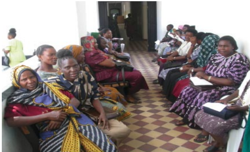
The Ocean Road Cancer Institute encourages women to come in for cervical cancer screening.

ship with the community so as to create and maintain an integrated, accessible and affordable health system with quality service as the focus and improved health and well-being as the constant standard. The Institute aims to prevent cancers, and for cancers which have already occurred to heal sometimes, to relieve often and comfort always.