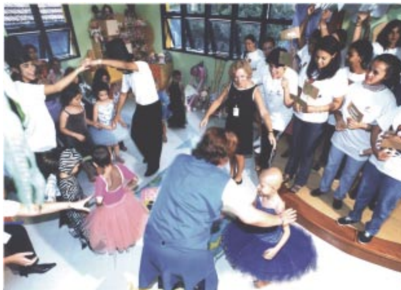
Children undergoing treatment at the Pediatric Oncology Hospital of the Medical University of São Paulo gather to help celebrate the inauguration of four laboratories for cancer diagnosis, which are supported by Banco do Brasil Foundation.

Of 41 institutions that provide structured pediatric oncology services in the country, 19 have already been selected to receive financial support for the acquisition of equip-