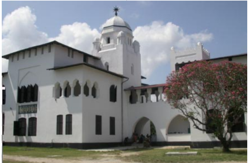
The Ocean Road Cancer Institute is Tanzania's first and only cancer treatment center. INCTR and IARC recently conducted a cervical cancer screening workshop for OCRI staff.

At the OCRI, both the adults and children on chemotherapy are under the care of a medical oncologist. Until recently, we had a medical oncologist from Germany who has since completed his seven-year contract; local doctors who worked with him are continuing to take care of the chemotherapy patients. Two radiation oncologists who had their training in the United Kingdom are part of the medical oncology team. All cancer pa-