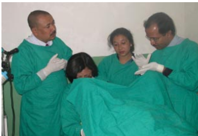
Doctors in Bhaktapur, Nepal, learn how to perform the loop electrosurgical excision procedure (LEEP) during a training course sponsored jointly by IARC and INCTR in March.

The use of these services does not require a laboratory infrastructure, and the results are obtained immedi-