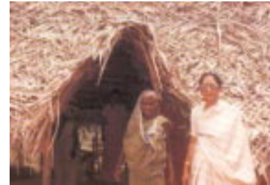
A healthcare worker from the Cancer Institute in Chennai visits women for cervical cancer screening in the privacy of their homes.

Chingleput survey: The first hospital-based, rural survey of cancer conducted in Chingleput district in 1961-